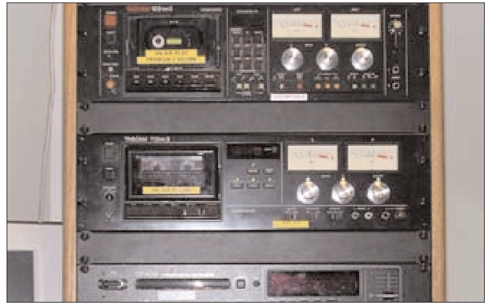
TOP; A close-up of some of the studio's cassette and compact disc players. BOTTOM; The boxes of supplies that would eventually move to campus.